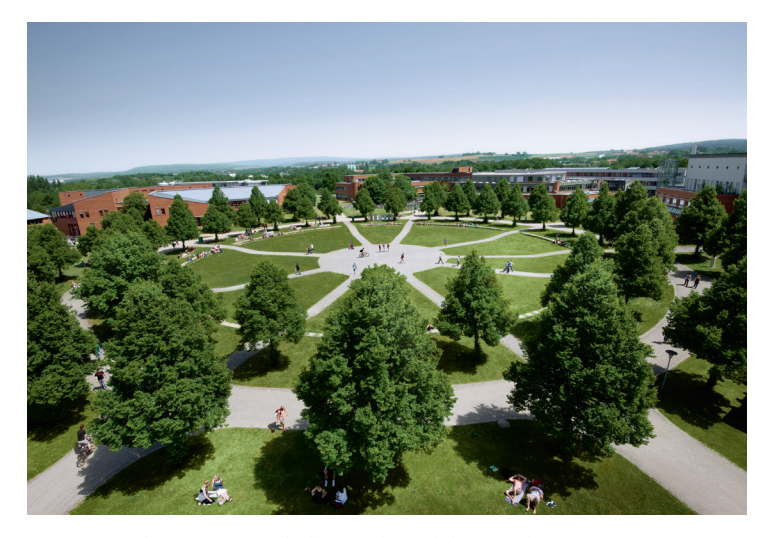
Our modern campus with short paths and the award-winning International Office provide an ideal environment for internationally oriented degree programmes.