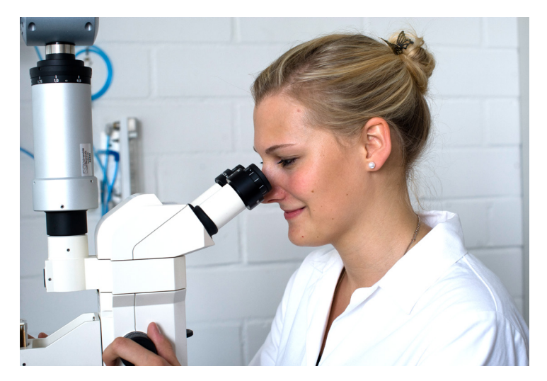
The programme offers a top-level selection of courses in English with a great deal of one-on-one supervision.